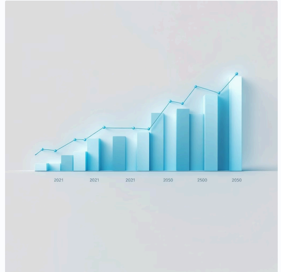
India's Senior Population: A Rapid Ascent

Assisted living facilities like Dua bridge the crucial gap between completely independent living and intensive nursing homes, offering a balanced approach to personalised care with emphasis on maintaining autonomy.