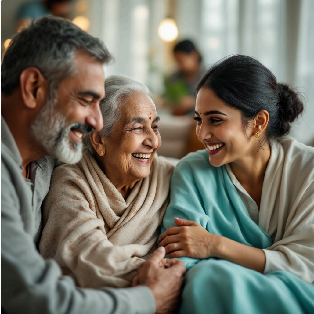
Reassurance for Loved Ones

Our unwavering focus is on creating a supportive ecosystem where seniors can thrive, and families can feel completely confident in their choice.