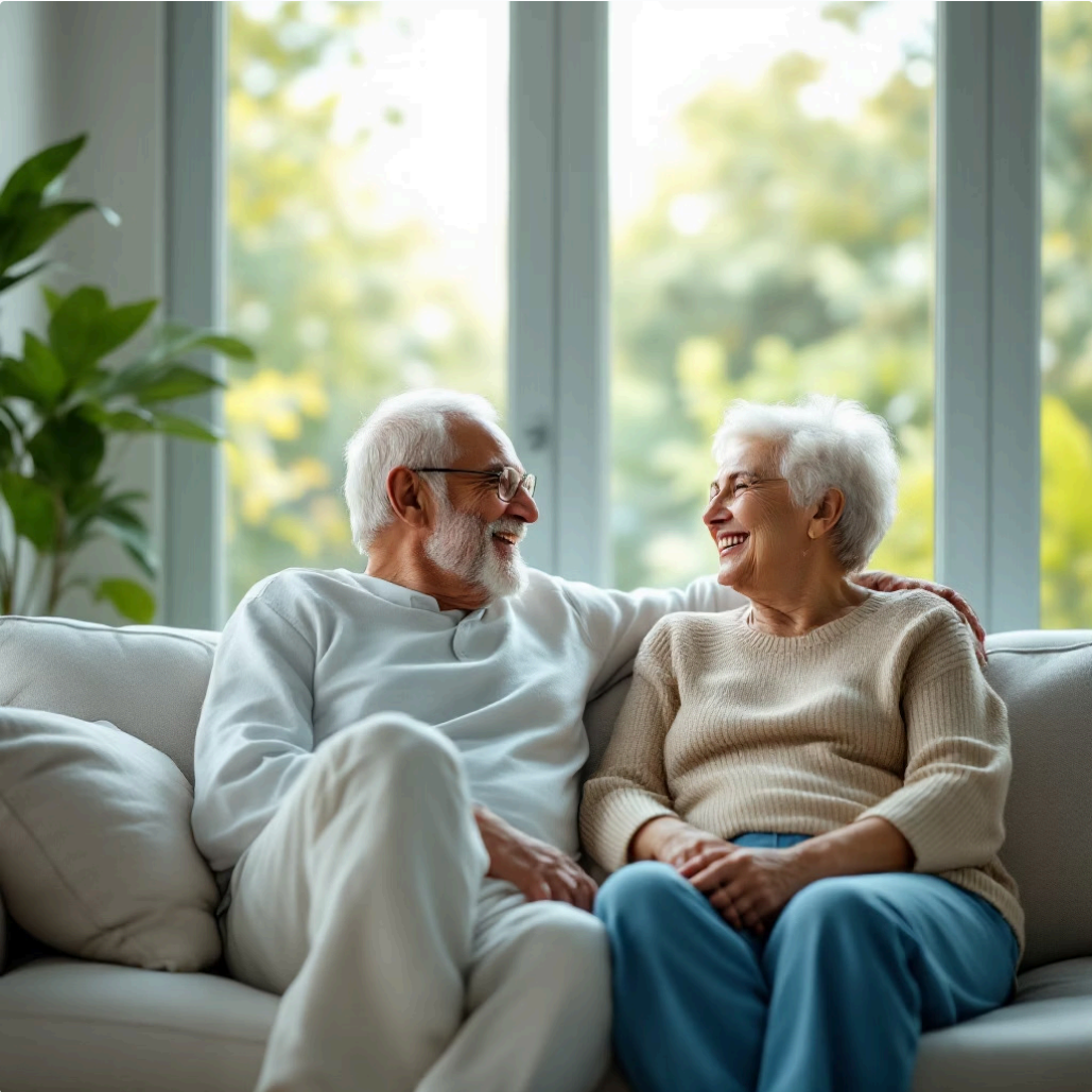
Dignity and Joy for Seniors

Families gain immense reassurance, knowing their loved ones are in a professionally managed, nurturing, and secure environment that truly feels like home.